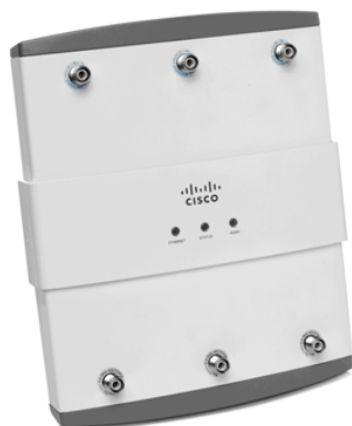
Figure 1. The Cisco Aironet 1250 Series Access Point

The platform was specifically engineered to support the power, throughput, and mechanical requirements of higher-speed WLAN technologies, including 802.11n. Currently, the platform provides both 2.4-GHz and 5-GHz modules compliant with the IEEE 802.11n draft 2.0 standard. As technology evolves, the platform is flexible to support future radio modules designed to deliver intelligent RF services, further enhancing the performance and reliability of the wireless network. The Cisco Aironet 1250 Series is a rugged indoor access point designed for both office and challenging RF environments such as factories, warehouses, hospitals and large retail establishments that require the antenna versatility associated with connectorized antennas, a rugged metal enclosure, and a broad operating temperature range. With a Gigabit Ethernet (10/100/1000) interface, the Cisco Aironet 1250 Series delivers line-rate throughput for higher-speed WLAN technologies such as 802.11n. The access point offers the flexibility of inline as well as local power options.